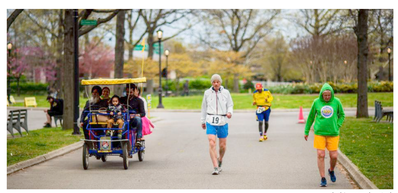
Flushing Meadow Park

on three sides, the planes that are coming in or starting very low from close by La Guardia airport and also to the unpredictable, extremely fast changing and often cold wind that rattles through the park much of the running time. It adds definitely a layer of challenge on top of the running itself. Fortunately the noise cancellation head phones are a big help and it is also astounding how quickly the body and the whole system adjust to these new conditions.