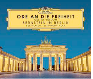
Ludvig van Beethoven